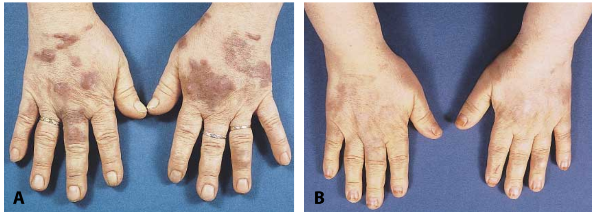
Fig 1. A, Hyperpigmentation induced by antimalarial agents in 65-year-old patient with cutaneous lupus erythematosus. B, Significant improvement 6 weeks after 3 treatments with QSRL.